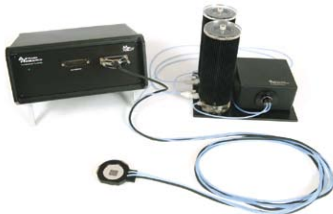
The CoolerHeater accessory includes the Environmental Controller, the coolant pump, and the sample holder stage.

The CoolerHeater stage, based on our Closed Fluid Cell design, seals out the ambient environment with an FKM (Viton® equivalent) rubber membrane and O-rings. Four O-ring sealed access ports allow for dry or inert gas purge, injection of fluids, or electrical access. Samples can be mounted on standard AFM sample discs and magnetically held to the temperature controlled metal surface. Metal clips can also be used to hold down samples. The temperature controlled surface is 15 x 15mm but can hold slightly larger samples. The temperature sensor is embedded in the sample stage and slight offsets to the actual sample surface temperature are to be expected. This surface is sealed into the heater assembly so liquid drop experiments can be performed without worry of damage or electrical short circuits. A top illuminated, top view (only) of the sample is possible with the appropriately outfitted MFP-3D AFM.