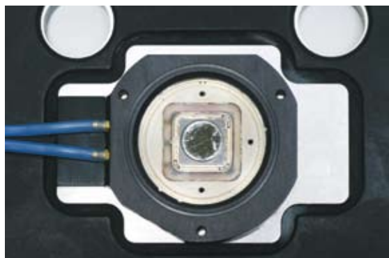
CoolerHeater stage with magnetically mounted 12mm mica disk.